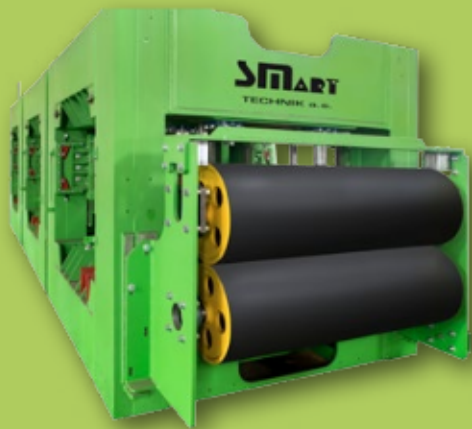
Used Tetra Pak packaging recycled by a SMART TECHNIK line