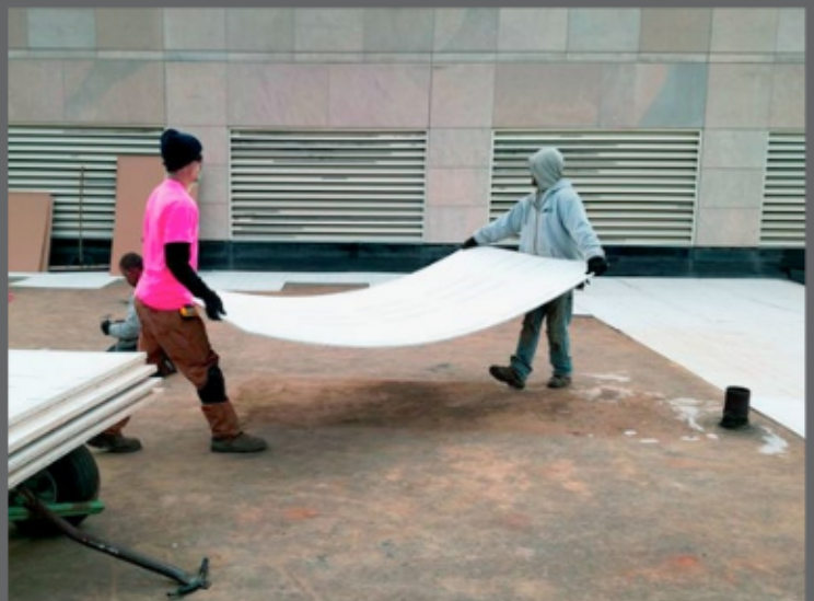
Boards are used for the ceiling system of roofs, highly flexible and resistant to mechanical damage (such as hail)