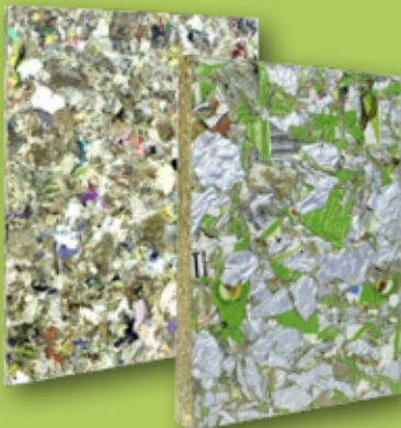
Products made from Tetra Pak waste