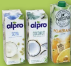
Used packaging Tetra Pak