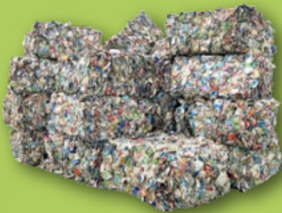
Used packaging Tetra Pak – municipal waste