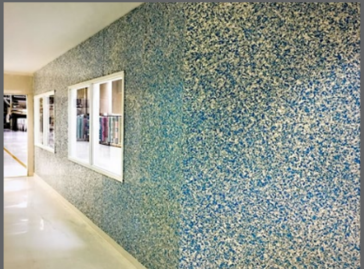
An example of interior supplied